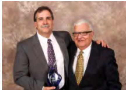
Business Excellence Awards