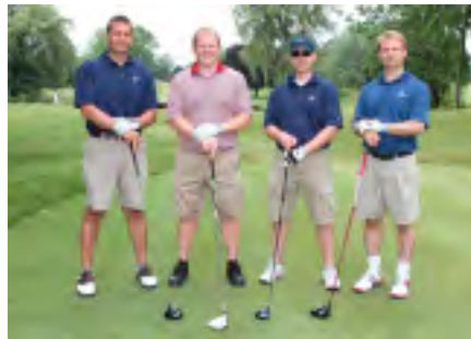
Scholarship Golf Classic, presented by TDS