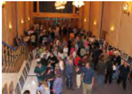
Downtown Community Workshop #2