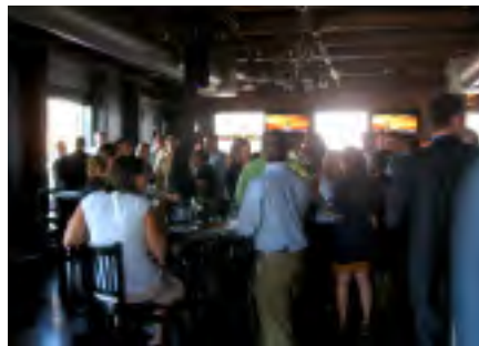
YLink Raise the Bar: Kenosha Downtown Development Update