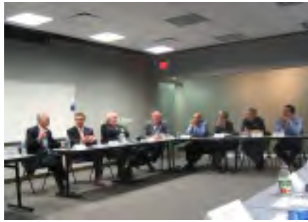
Business Roundtable with Sen. Ron Johnson