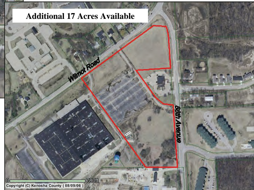
Additional 17 Acres Available